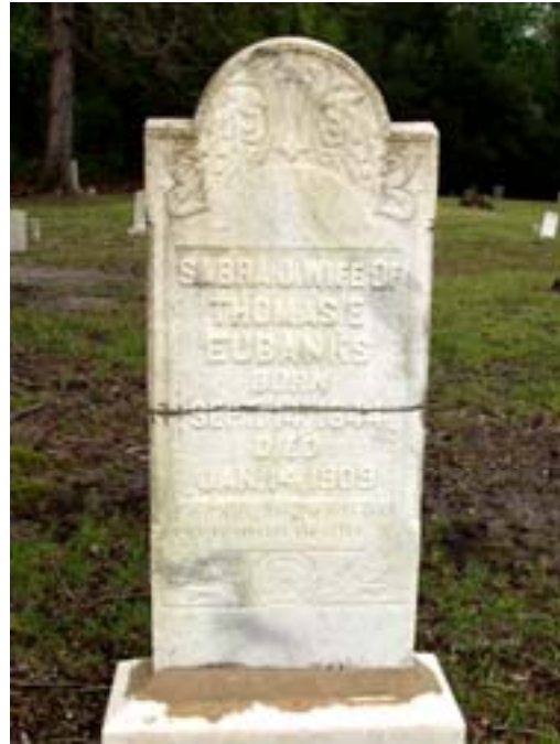
18. Sabra J. Eubanks Wife of Thomas E. Eubanks September 14, 1844 - January 14, 1909