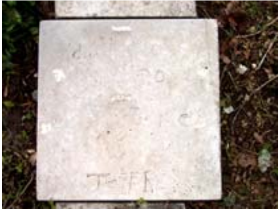
25. Unidentified No Dates