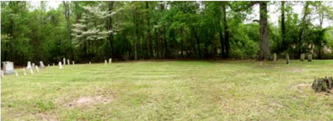
Figure 3 Unmarked gravesites, facing south