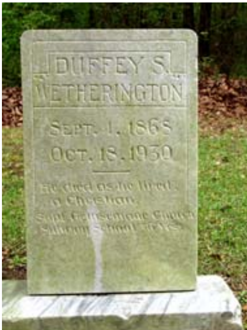
67. Duffey S. Wetherington September 1, 1868 – October 18, 1930