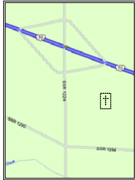
Figure 1 Location Map

Now maintained by the nearby Gethsemane Free Will Baptist Church, the cemetery contains over seventy gravesites dating from 1876 to 1939. Not exclusively the Stewart family, many of the names appear on the early rolls of the Gethsemane FWB Church.