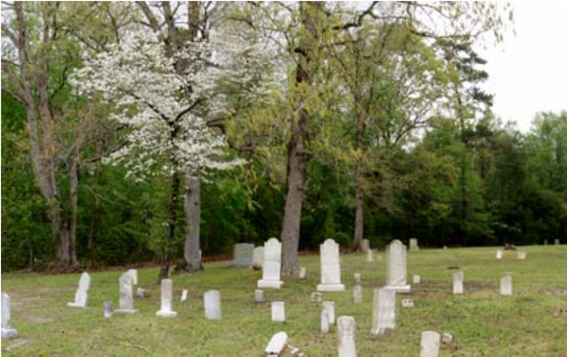
Figure 4 Stewart Cemetery, facing northeast

The reference list also includes additional known detail on the person interred and these are numbered to the photographs.