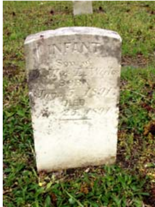
14. Infant Son of M. T. & L. Weeks January 5, 1891 - January 25, 1891