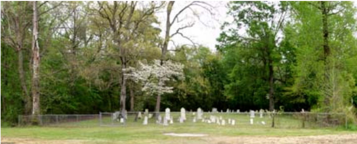
Figure 2 View of Stewart Cemetery, facing east